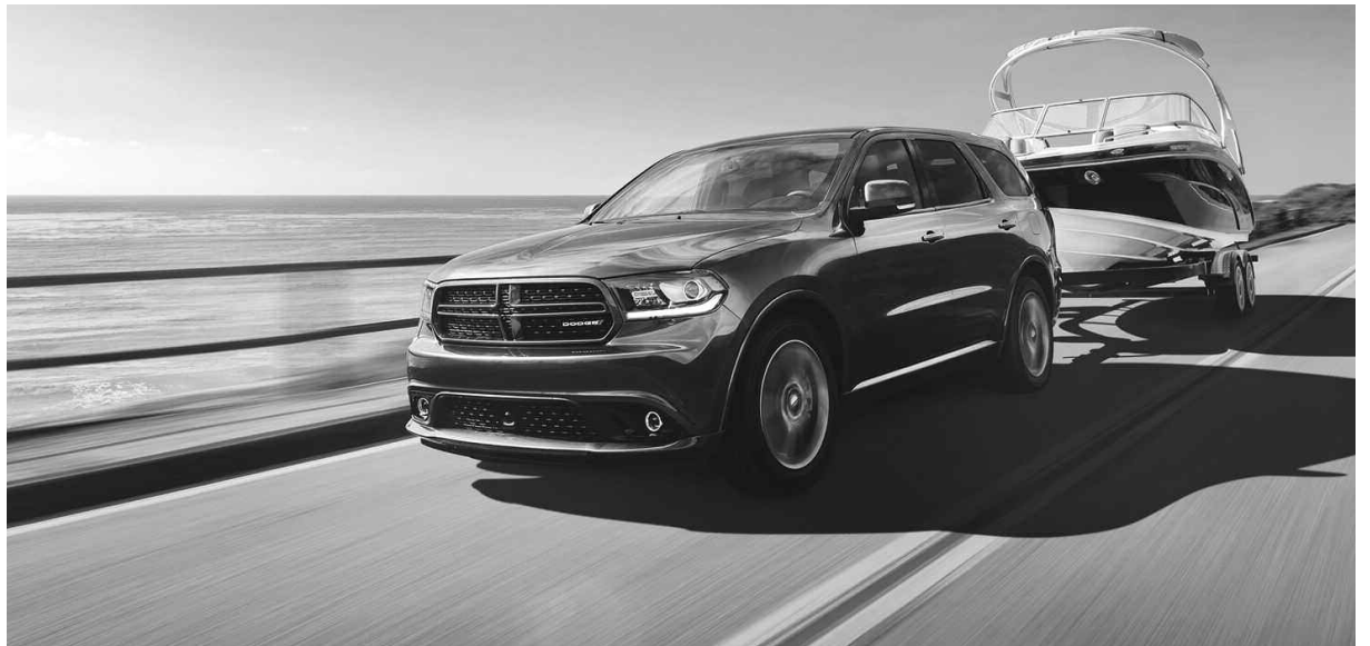
The 2015 Jeep® Grand Cherokee and Dodge Durango (shown here) are Must-Shop SUVs for Towing according to AutoTrader.com, which recognizes SUVs that offer the perfect combination of towing ability and interior luxury.